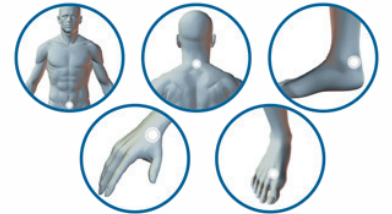
• Patented form of phototherapy