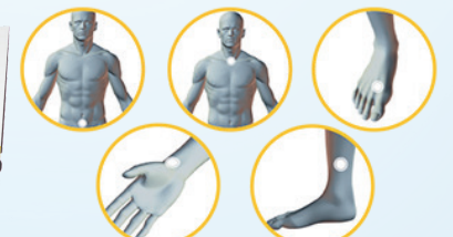
• Patented form of phototherapy