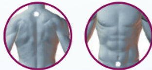
• Patented form of phototherapy